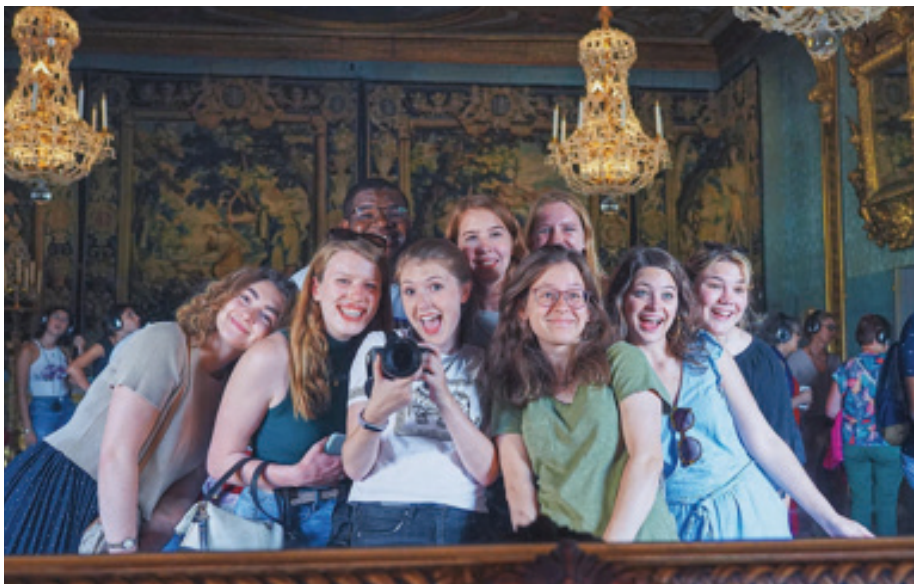
Top left: La Joie d’étudier en France: visiting the Château de Versailles