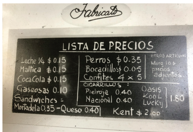
Archive photo of price list from Fabricato, Colombia