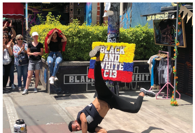
B-Boys dancing in the streets of Comuna 13. Hip-hop culture is very important for the community, especially the youth, at Comuna 13.