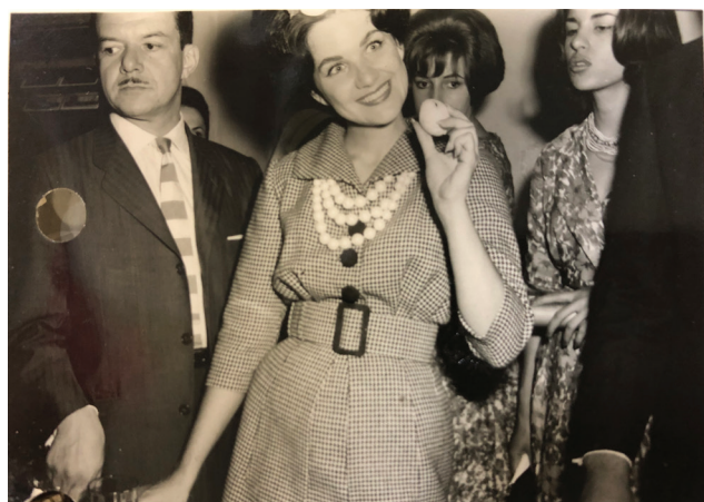
1960s Miss Universe Linda Bement visits Medellín