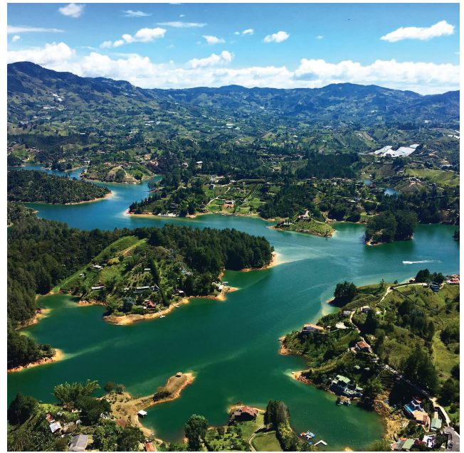
Beautiful view of Guatapé region, in Eastern Antioquia.

I'm currently on a tour bus with brakes like a dying parrot, screeching back down the mountain. Today we adventured with our fellow travelers to Guatapé, a small town about two hours from Medellín, with houses painted every color of the rainbow. Little designs illustrated on the baseboards of every house called zocalos, keep pace with you every step of the way. Our tour included a typical hearty Colombian breakfast, complete with rice, beans, scrambled eggs, an arepa, and caramelized plantains. The first stop was a beautiful boat ride around the nearby, man-made lake featuring Pablo Escobar's old vacation home, now a charred remains after it was bombed. We also conquered La Piedra or "the rock" which consists of a 700+ stair climb and culminates in a breathtaking view of the surrounding lakes and hills. Although I'm now exhausted, I've had a thorough introduction to the incredible landscape of Antioquia today.