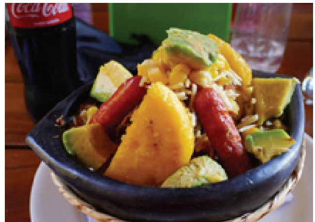
Cazuela de Fríjoles (Bean stew). Traditional dish from the Antioquia region. A bean stew with rice, avocado, plantains, chorizo and, more often than not, a fried egg to top it all off. Delicious.