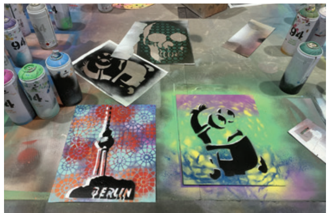
Above: Berlin Street Art Tour and Graffiti Workshop. Below: Our Artwork

fellowship. Unfortunately, COVID-19 delayed or condensed some programs. Our spring 2020 Berlin study abroad participants were also caught off guard by the rapidly developing pandemic in Europe. After the travel advisory was raised overnight, the students were evacuated on extremely short notice. Of course, our majors are resilient, and continued their studies online, though taking classes virtually cannot replace the missed experiences. To provide at least some students with the opportunity to continue their education abroad, we are working tenaciously on this year’s fellowship applications. Stay healthy, and keep your fingers crossed!