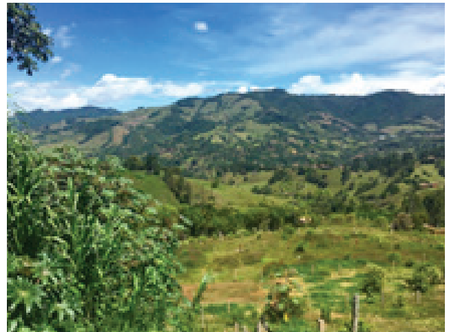
Green pastures of the Antioquia Valley.