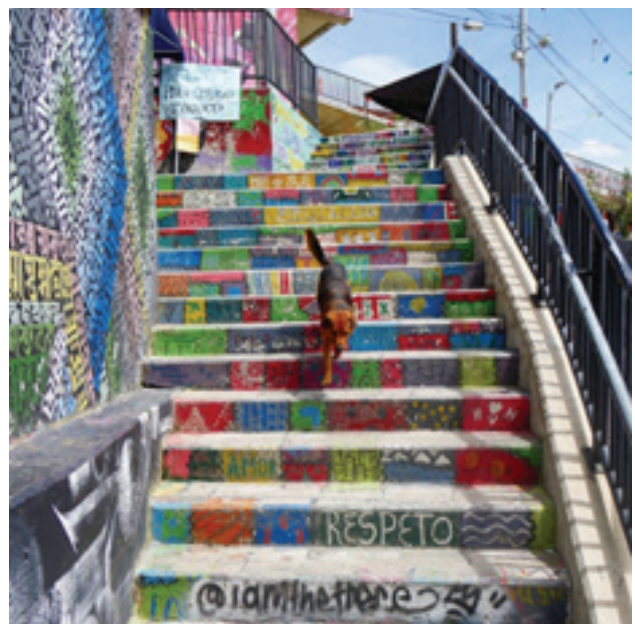
Respeto/ “Respect”: Encouraging words embedded in Comuna 13’s street art.