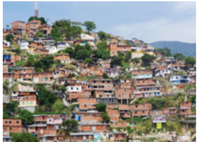
Houses in Comuna 13, Medellín. Historically, Comuna 13 in Medellín has been a disfranchised neighborhood in the edges of the city. However, each house stands proud surrounded by the beautiful mountains of the Andes and colored by the vibrant street art created by their residents.

This reminds me: How can airplane coffee be this good?