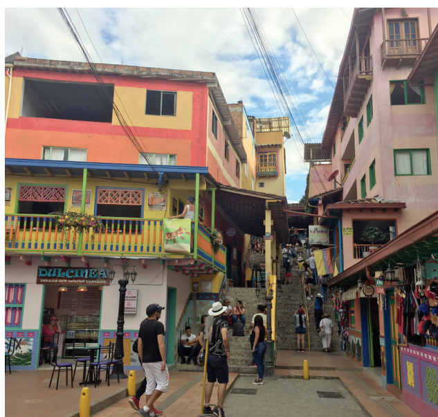
Medellín, always so colorful.

I guess it is true when they say you learn something new every day, even about your own country.